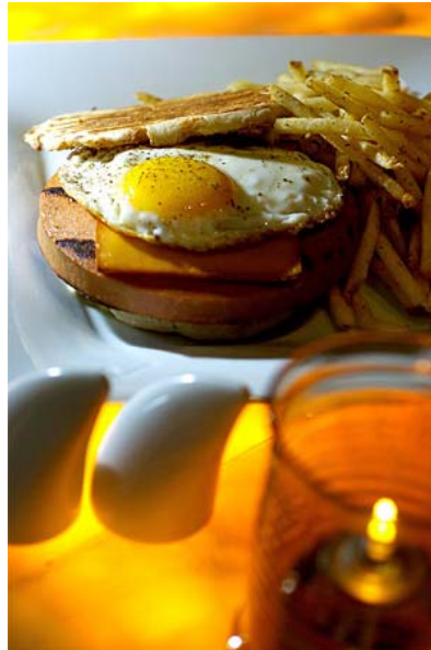
Lola's fried bologna is signature Symon.