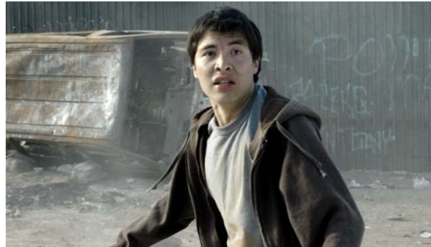
Sangre de mi Sangre (Blood of my Blood)

Founded in 1882, The Cleveland Institute of Art is an independent college of art and design committed to leadership and vision in all forms of visual arts education. The Institute makes enduring contributions to education and extends its programs to the public through gallery exhibits, lectures, a continuing education program and The Cleveland Institute of Art Cinematheque, an art and independent film program.